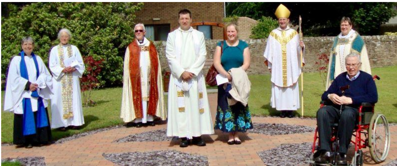
Congregation and guests enjoying the sunshine